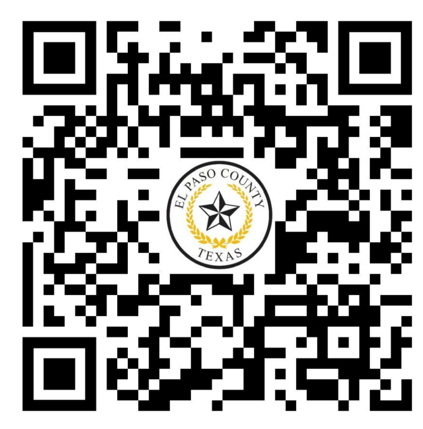
Submit your feedback here.