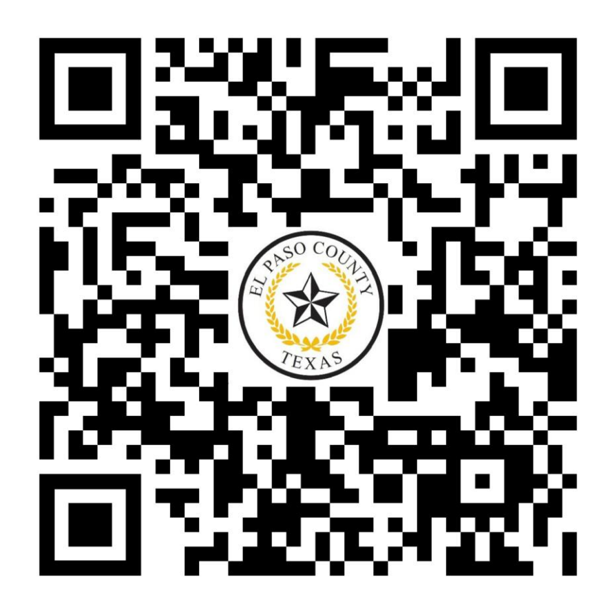
Envie sus comentarios aquí.